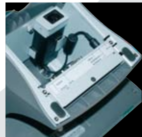
Integrated power supply adapter