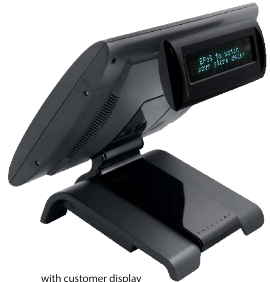
with customer display