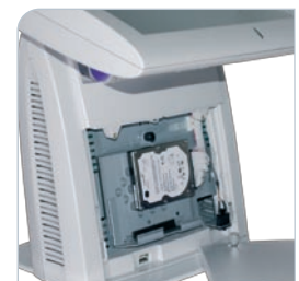
Accessible hard disk and USB